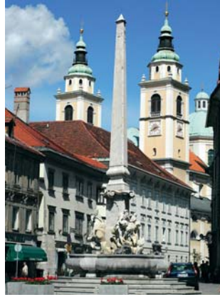
Robba's Fountain in Ljubljana, erected in 1751, symbolising the Sava, Krka and Ljubljana rivers.

The capital, Ljubljana, is the largest city as well as the political, administrative, economic, educational and cultural centre of Slovenia. Ljubljana's history goes back several thousand years. Archaeological findings from the Bronze Age are proof that as early as 2000 BC there were pile-dwellings of fishermen and hunters on the lake which once covered the Ljubljana basin. Prior to the Roman colonisation, Roman legionaries erected fortresses alongside the River Ljubljana, which subsequently grew into the walled Roman settlement of Julia Emona. The city, with its castle originating in the 12 th century and its old city centre, also boasts a rich medieval heritage, as well as numerous Renaissance, Baroque and Secessionist buildings.