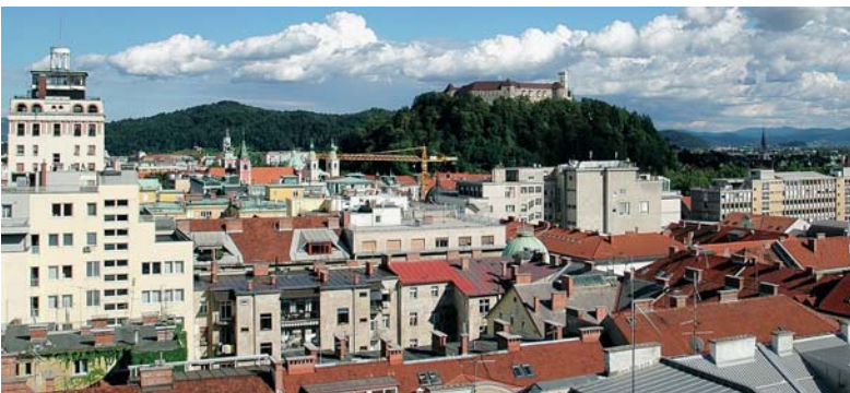
Ljubljana, the capital of Slovenia, with the castle in the background.